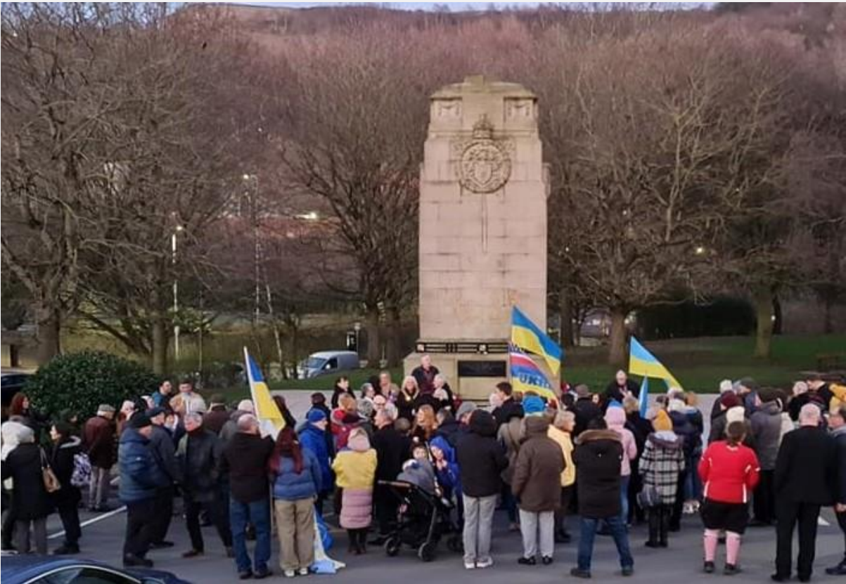
The Minster hosted a vigil on behalf of the Ukrainian community to mark the first anniversary of the Russian invasion