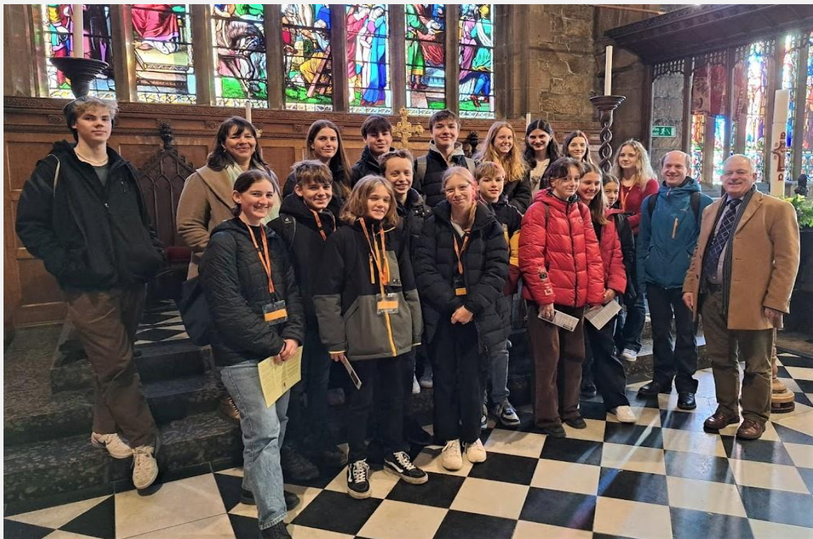
Exchange students from Aachen visit the Minster