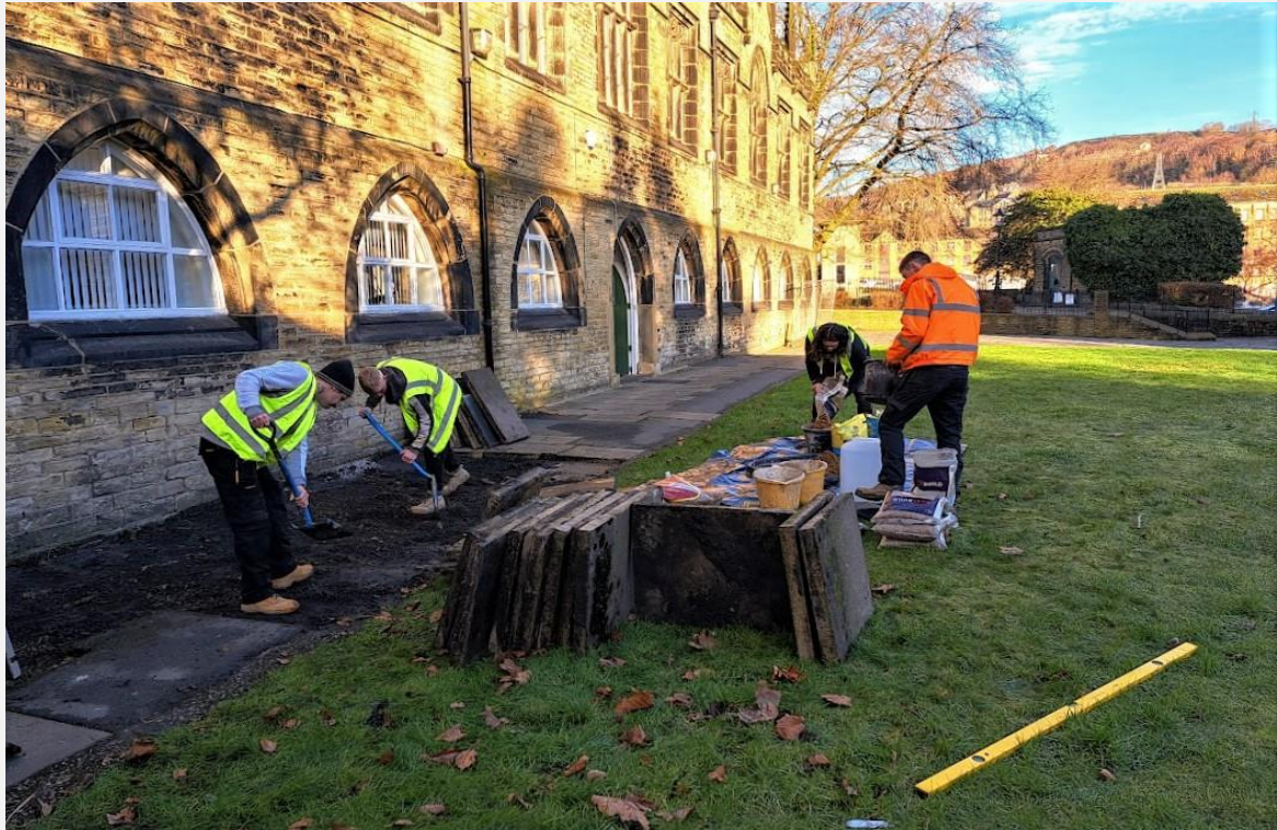
Apprentice Builders, Decorators and Joiners from Calderdale College spent a day at the Minster.